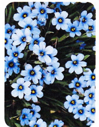
CALIFORNIA BLUE-EYED GRASS

Better Plants. Better Service. Better Prices.