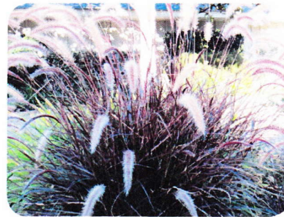
RED FOUNTAIN GRASS