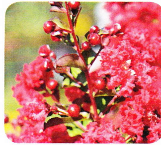
CRAPE MYRTLE 'DYNAMITE'