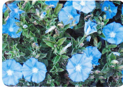
GROUND MORNING GLORY